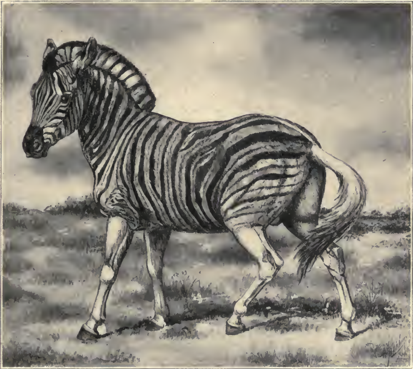
FIG. XXIV. EQUUS BURCHELLI. BURCHELL'S ZEBRA.